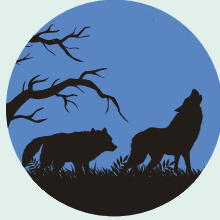
The dark night