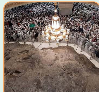
Present Day Mount Safa

"You gathered us here for this?! May you perish!"